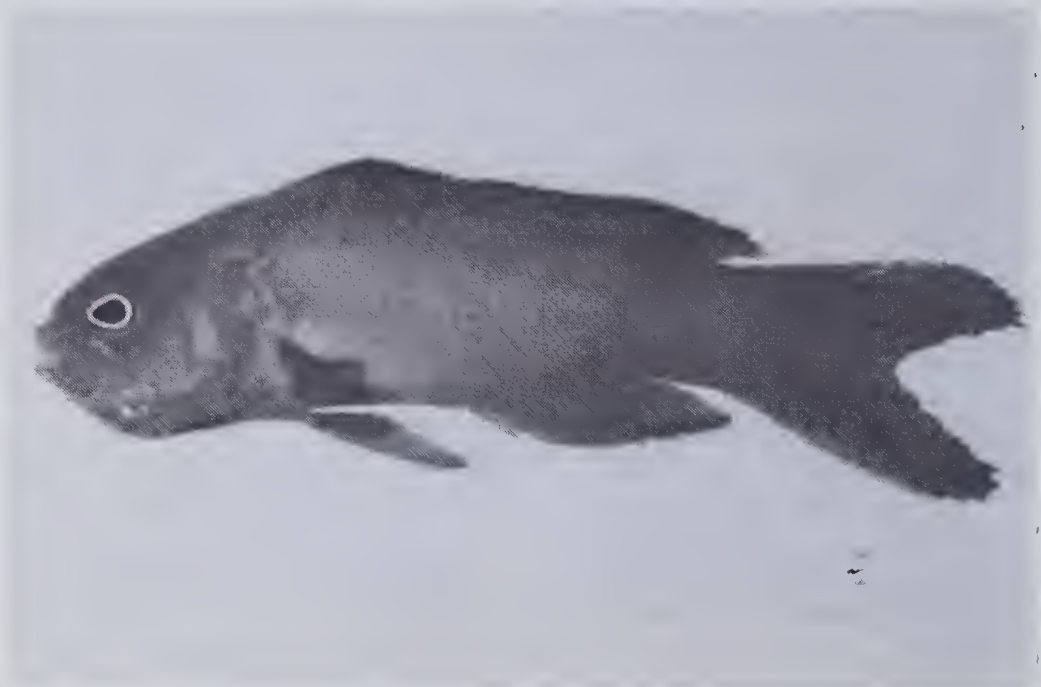
Fig. 2. Assessor macneilli , 35.6 mm SL, male with egg mass in oral cavity.

Hatching was not witnessed. Evidently it takes place at night as the fry were usually discovered in the early morning. The larvae, which swim close to the surface, are mostly transparent and four to five mm in total length. Unfortunately they did not live more than a few hours.